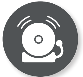
Fire Detection & Alarm