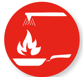
Fire Suppression Systems