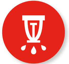
Fire Sprinkler Systems