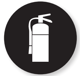
Fire Extinguisher Service

We also provide a customer web portal for your convenience – Keystone Client Connect™ – for easy retrieval of information. You're just a mouse-click away from having access to inspection reports, invoices, service call reports, and more.