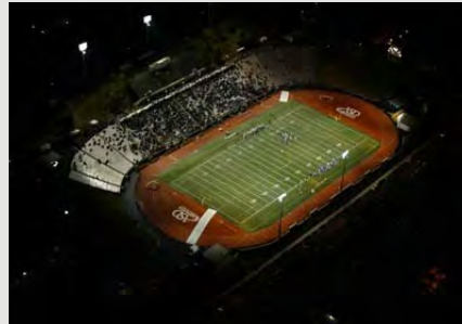
J. Birney Crum Stadium