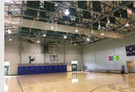
Pennridge Central Middle School